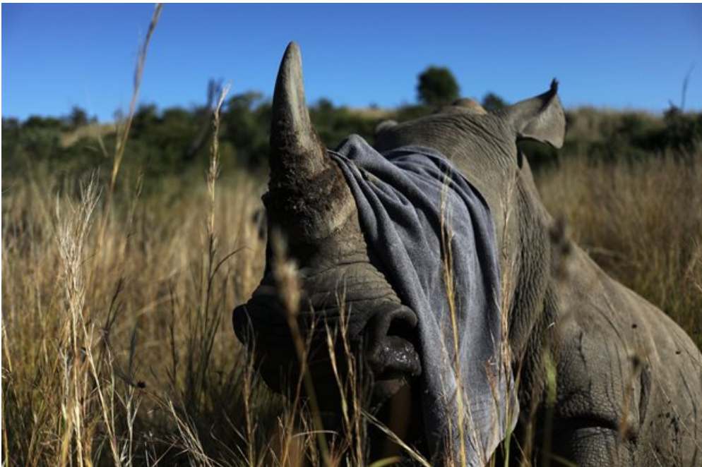
A towel is used to cover the eyes of a tranquillised rhino before it is dehorned in an effort to deter poaching at the Fliandesberg Game Reserve.

Rhino poaching is on the rise again in South Africa since the government loosened coronavirus restrictions, following a year-long lull due to the pandemic, wildlife parks say.