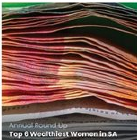
Annual Round Up Top 6 Wealthiest Women in SA