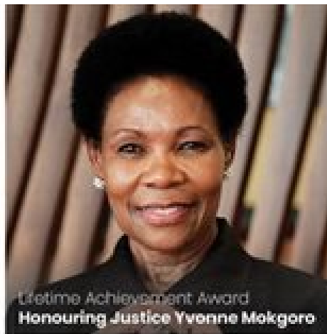
Lifetime Achievement Award Honouring Justice Yvonne Mokgoro