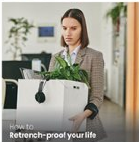
How to Retrench-proof your life