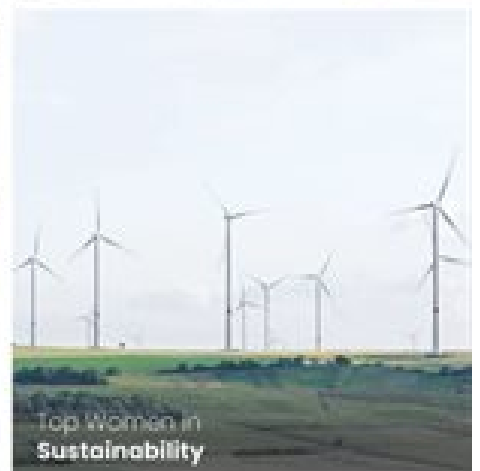
Top Women in Sustainability