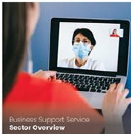
Business Support Service Sector Overview