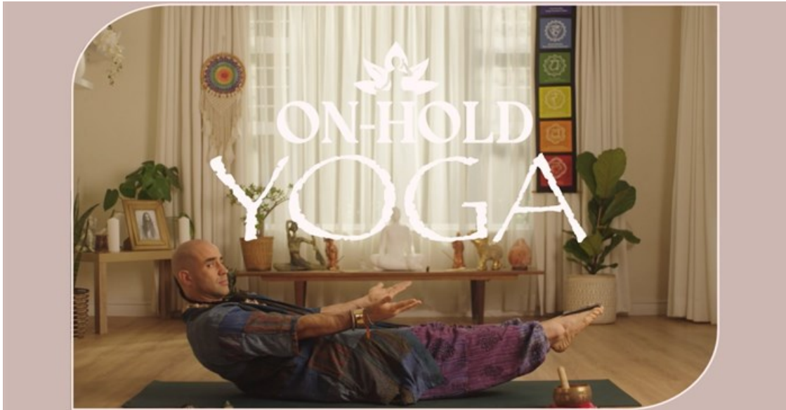
Image supplied. Naked's On Hold Yoga digital campaign takes a humorous look at the frustrations of waiting on hold for a call centre agent

Naked's On Hold Yoga digital campaign takes a humorous look at the frustrations of waiting on hold for a call centre agent.