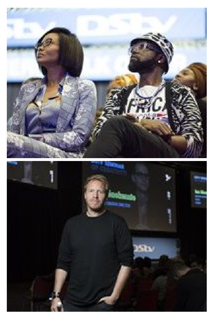
Follow <u>#dstvseminarofcreativity</u> and/or <u>#seminarofcreativity</u> for what went down.

Go to our <u>Loeries special section</u> for the latest updates and live coverage of the 40th annual Loerie Awards (including the seminar), taking place in Durban from 16 to 19 August 2018. Also make sure to follow us on Twitter <u>@Bizcommunity</u> and <u>@Biz_Marketing</u> for live tweets throughout Creative Week.