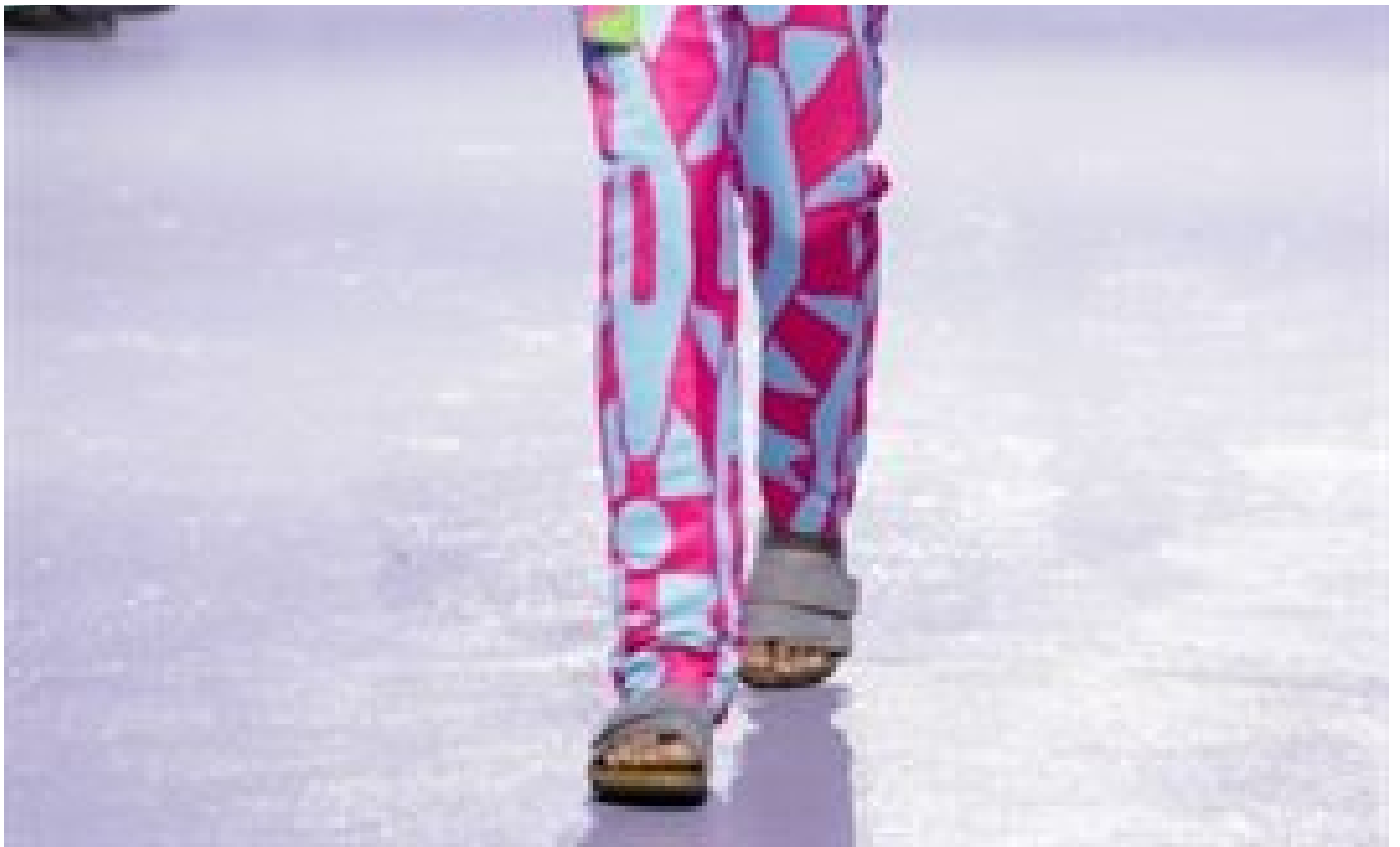
Inprint. Image by Simon Deiner