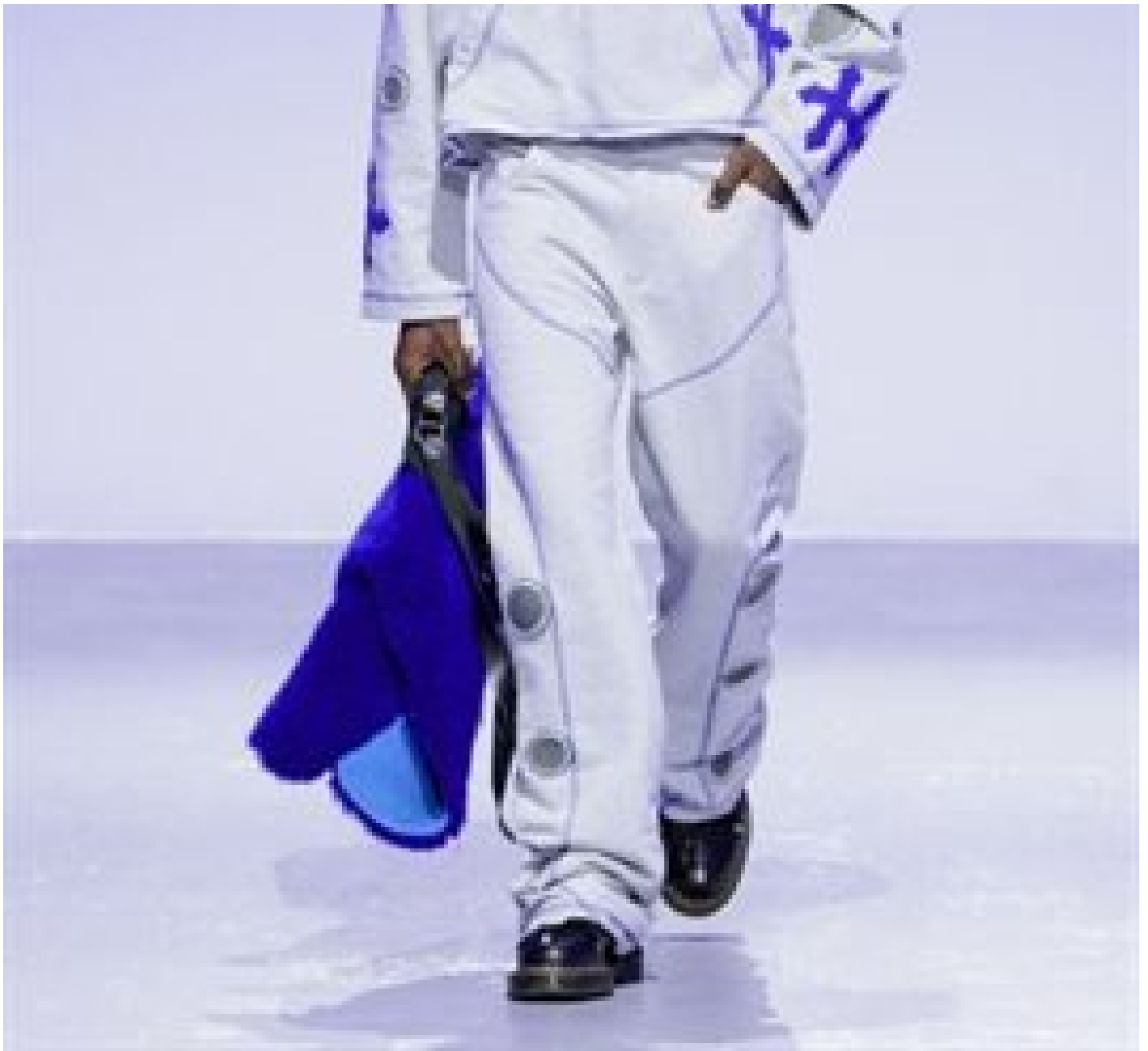
King on Horses. Image by Simon Deiner