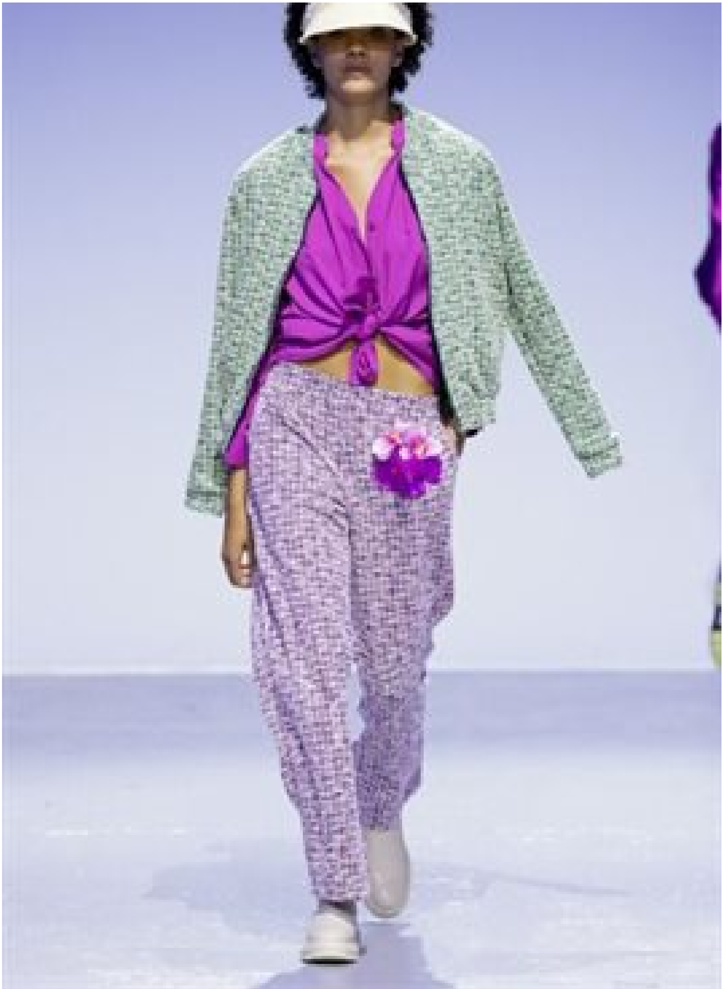
Signature by Des.