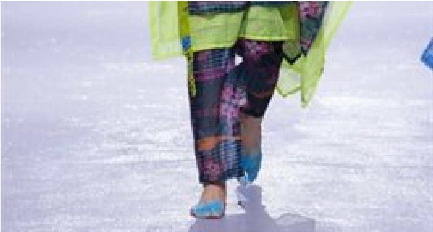
Masa Mara.