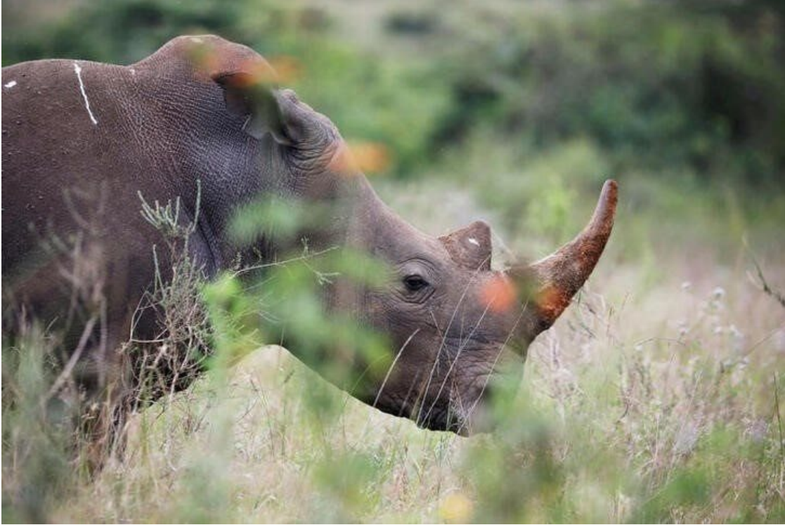
A southern white rhino is seen inside Nairobi National Park in Kenya, June 15, 2020.

The number of endangered rhinos poached in Namibia reached an all-time high last year after 87 animals were killed compared to 45 in 2021, official government data showed on Monday, 30 January.