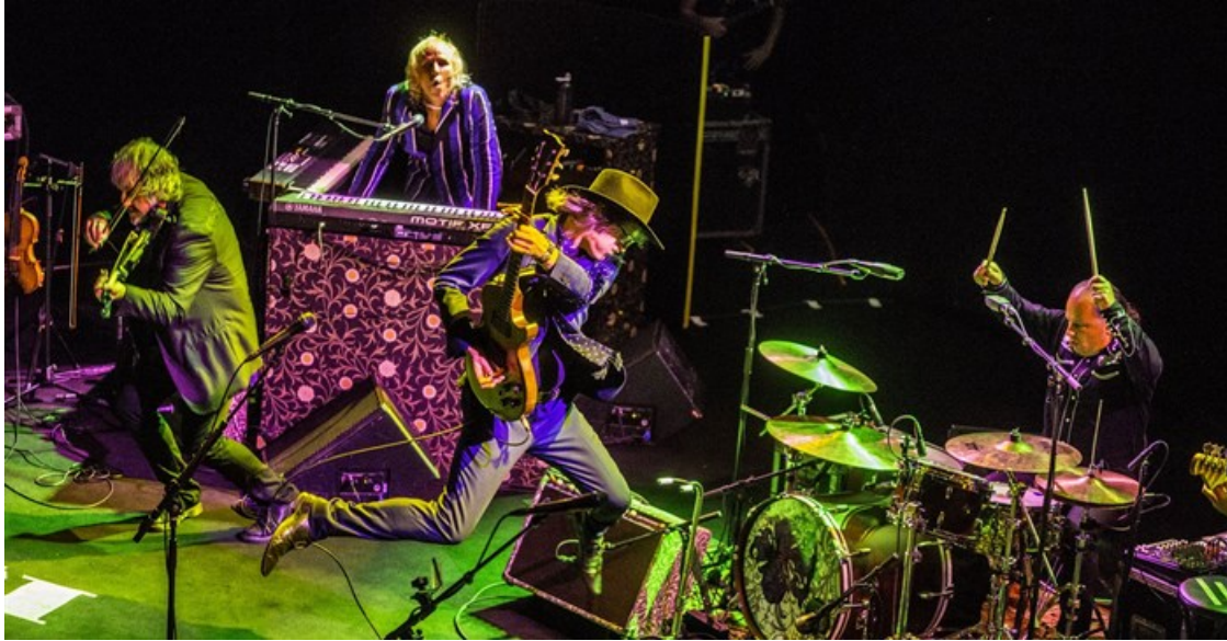
The Waterboys are coming to South Africa in November

Rock band the Waterboys will be performing in South Africa next week after the original concert was cancelled due to Covid in 2020 and 2021.