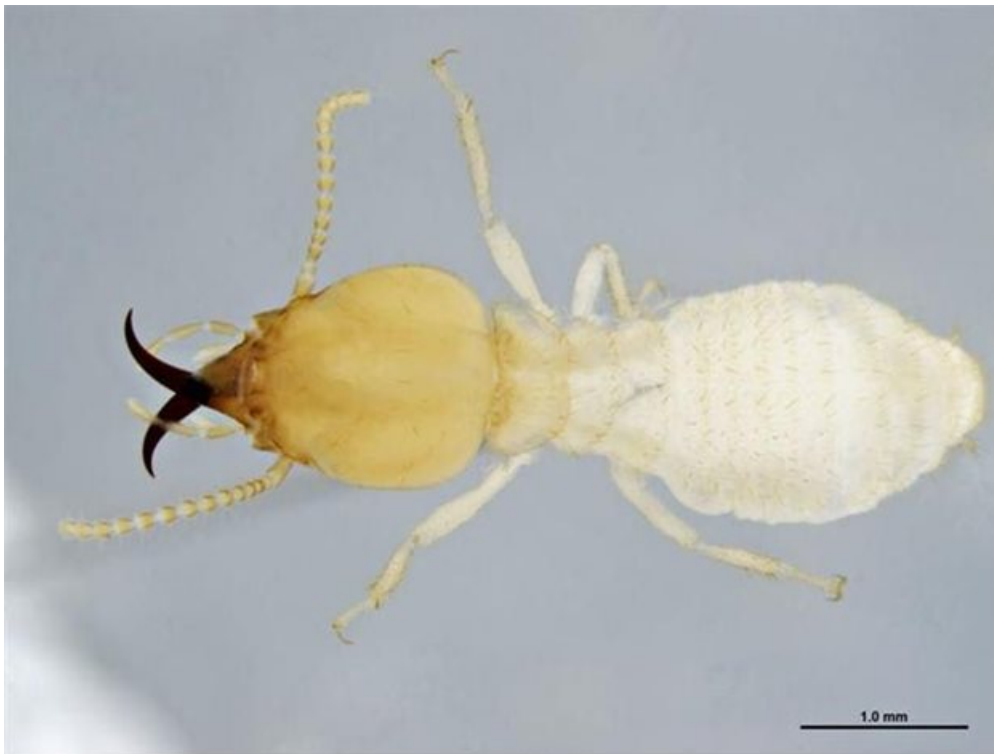
Rubber termites ( Coptotermes curvignathus ) are native to Indonesia, but are an invasive pest elsewhere.

The termites have LDPE in their guts, but we're not yet sure if they are digesting the plastics entirely or just breaking them up into micro and nano-plastics. Some termites cultivate microorganisms in their nests which can degrade LDPE plastics. Do ours? If not, introducing new termites or microbes that aren't indigenous to Sumatra might create even bigger problems.