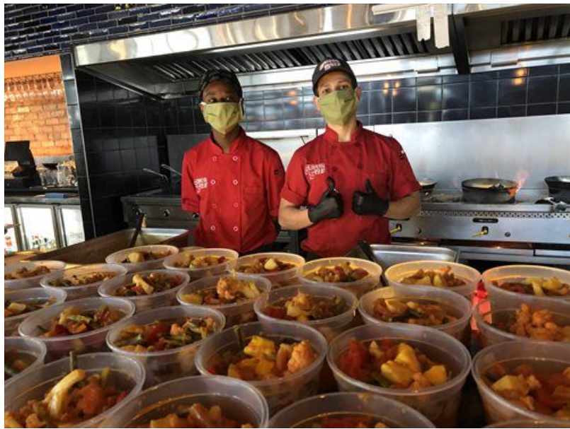
Saigon Suzy in Parkwood