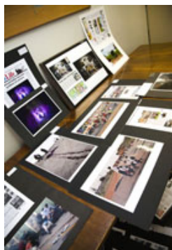
Some of the entries in this year's Mondi Shanduka Newspaper Awards.