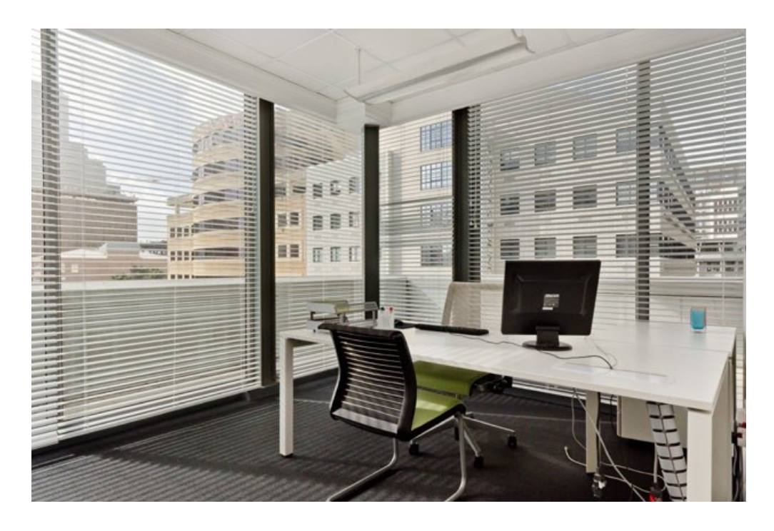
# Are there any expansion plans on the cards for Cube Workspace that you can share?

It's crucial to building our brand and a brand that South Africans can associate with serviced office space. I want Cube Workspace to be a synonym for premium serviced office space and targeted content marketing is paramount to achieving this goal. We utilise a range of the best marketing service providers to assist us in achieving this goal and ensure that our communications strategy isn't stagnant but evolves with the market and stays ahead of our competitors.