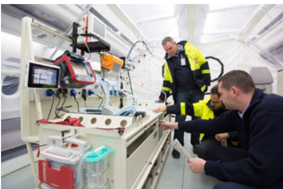
Lufthansa technicians at work on the conversion.

The aircraft conversion, which started on 17 November in Hamburg, was carried out in partnership with the Robert Koch Institute (RKI). In the middle and rear of the long-haul aircraft, passenger seats, kitchen and washing areas, and baggage lockers were removed to make way for a patient transport isolation unit surrounded by an airtight tent with negative pressure. Inside, medics can provide patients with intensive care and treatment during the flight while remaining fully protected. Two exterior tents, which are also airtight, serve as buffers so that the treatment tent can be entered and exited safely.