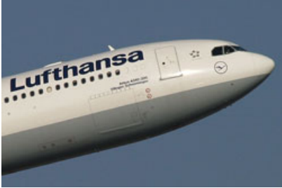
Villingen-Schwenningen before it became Robert Koch.