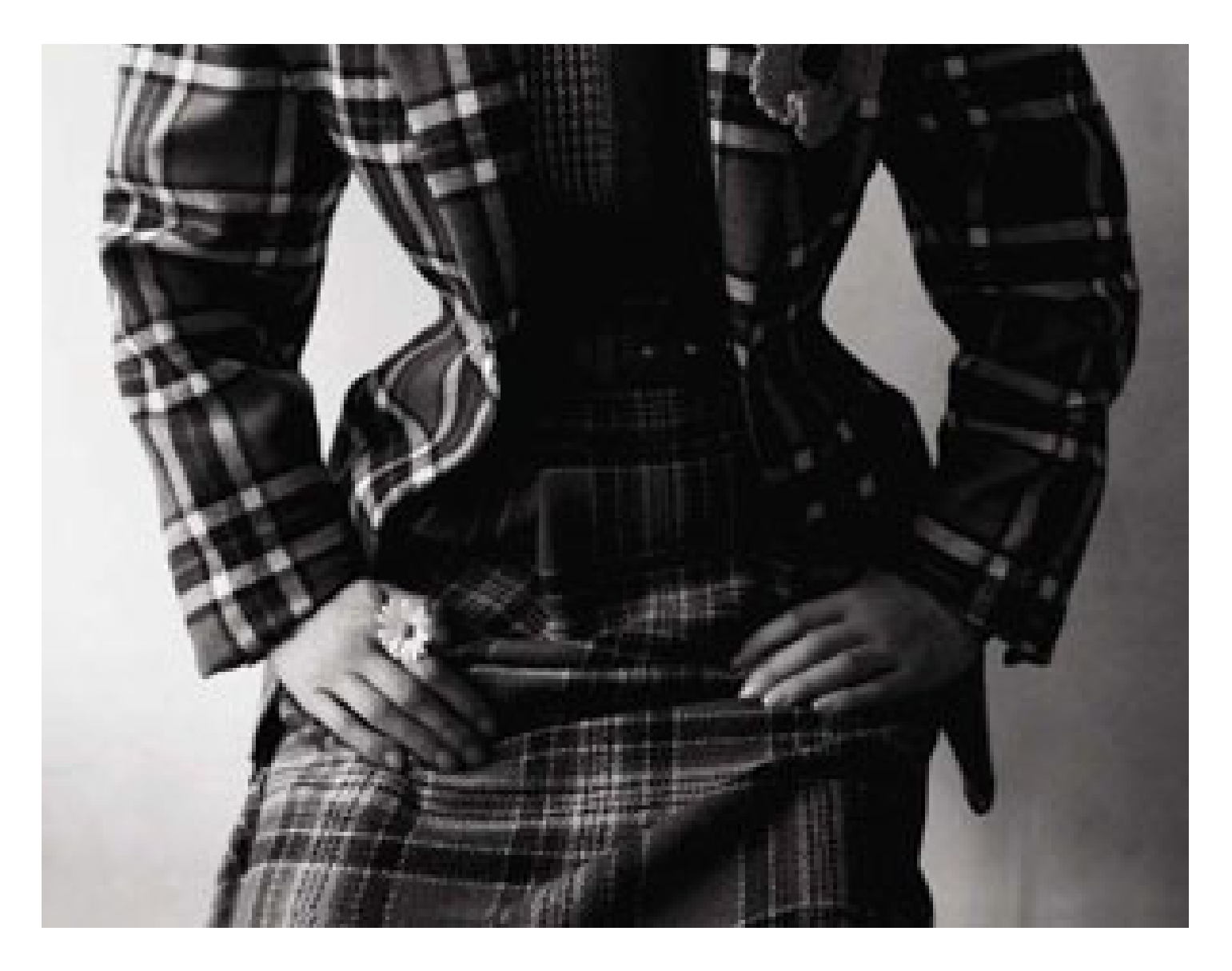
III How do you see the trend of neo-trans and gender fluidity in fashion developing in 2017?

In the past year it has definitely gained momentum with more designers embracing gender fluidity in their collections, mimicking the shift in fashion which calls for an acceptance of style without boundaries, codes or structures. This is strong reflection of how the youth is dressing now and part of the millennials challenge to rigid classification and pre-packaged looks. We are experiencing the leading edge of a disruptive fashion dynamic, which could easily be displaced by a counter trend or movement soon.