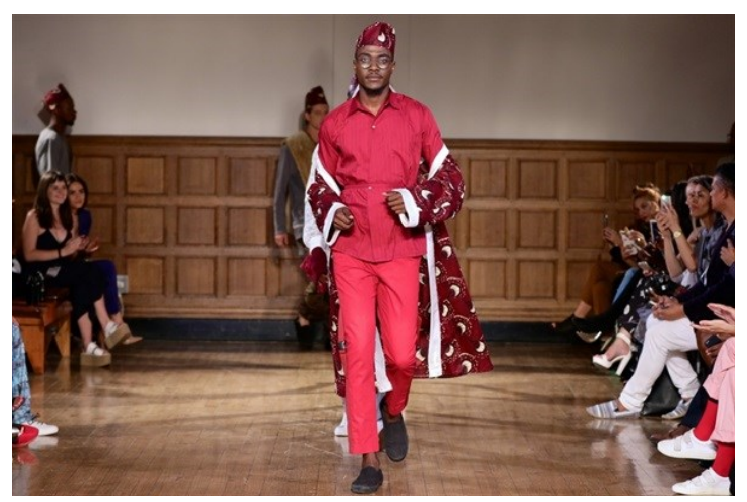
House of St Luke.