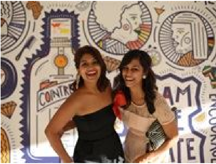
The crew comprises of a remarkable and independent set of women from various industries.

For more, visit: https://www.bizcommunity.com