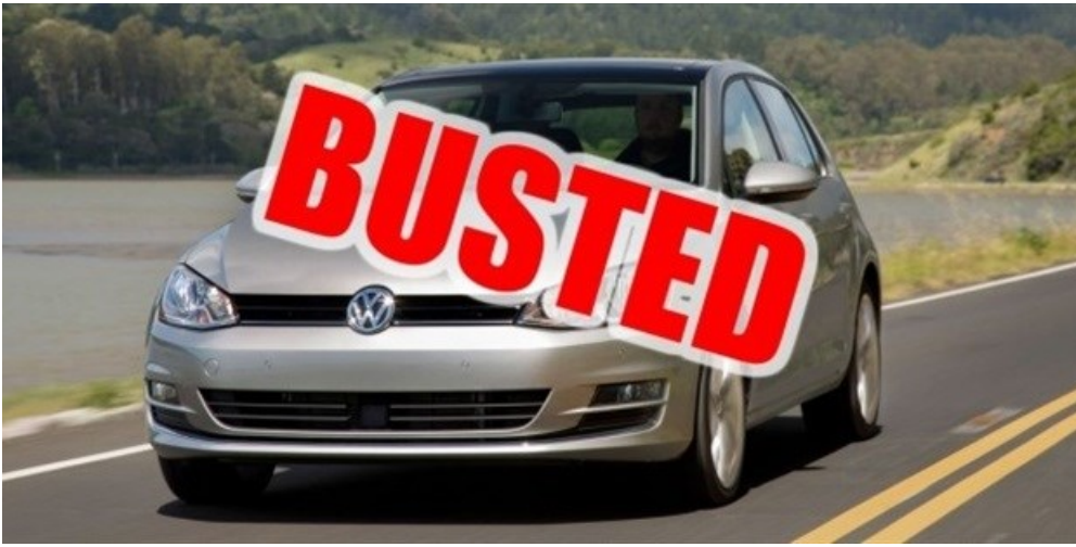
VW drives right into a scandal.

First it was Volkswagen. Now Mitsubishi has been forced to apologise after confessing it had exaggerated the fuel economy of more than 600,000 cars. Japanese government officials have raided one of its offices and research facilities, forcing the company's share price to drop to an all-time low.