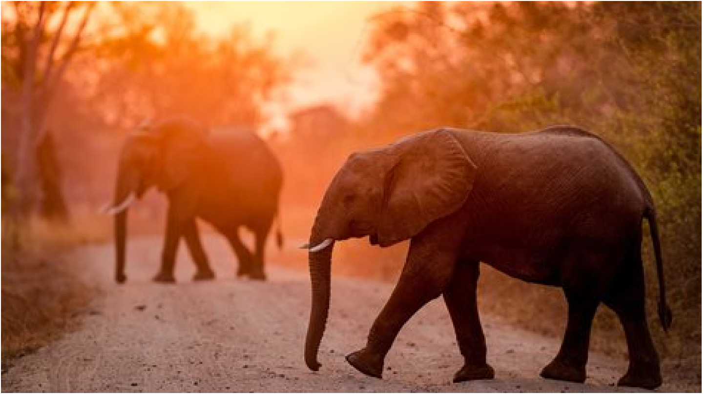
Elephants 2 Rudi van Aarde

The research team realises that great effort and socio-political will is needed to make such connections.