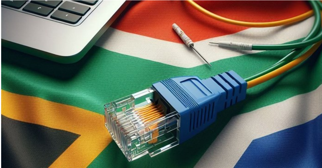
A tough day at the office for internet users in South Africa

Some chaos hit South Africa at lunchtime today as Microsoft battles a service outage across the Europe, Middle East, and Africa (EMEA) region that has left businesses and private users high and dry without access to cloud services like Microsoft 365, Teams, and Azure.