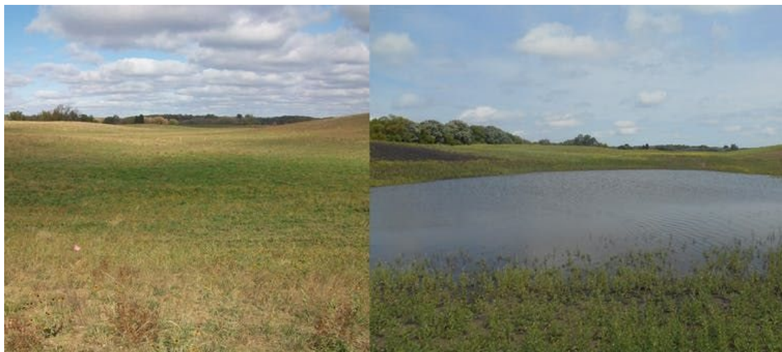
A prairie wetland in Minnesota, formerly part of a crop field (left) and restored to provide habitat for water birds (right).

Another USDA initiative, the Farmable Wetland Program , pays farmers to take previously farmed wetlands and buffer areas out of production for 10 or more years. Enrollment is currently capped at 1 million acres. A climate-smart agricultural policy could expand the program by removing the acreage cap and boosting incentive payments.